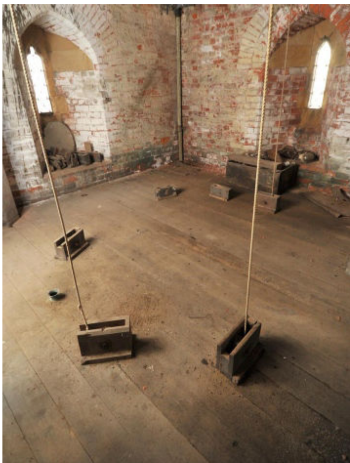
SILENCED: Inside the bell tower at St James' Church. The fund-raising effort requires £81,500 to be raised to restore the bells to their original glory