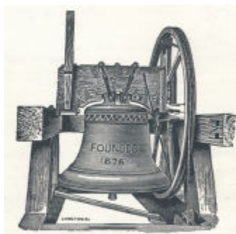
The Lancashire Association of Change Ringers